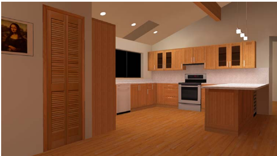
FIG. 2 – Typical Helios32 environment

FIG. 2 illustrates a typical Helios32 environment with 19 luminaires, 7,935 surface elements, 15,172 vertices, and 24 textures. This environment requires approximately 50 MB of memory. When the radiosity calculations are performed on an Intel i7 quad-core CPU with 8 MB of cache memory, the average CPU usage (as shown in FIG. 1) is 80 percent. In other words, the cores are spending approximately 20 percent of their time waiting for data to be transferred from main to cache memory.